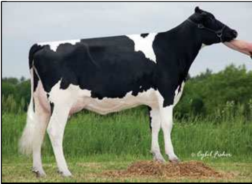
MGD: Welcome Goldwyn Gracie-ET EX-90, EX-MS